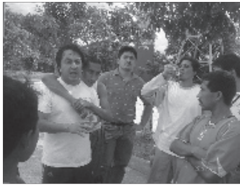
Guatemalan youth congregate at a rehabilitation center.

Several broad social factors contribute to youth violence in Central America. One of the factors most strongly associated with violent behavior by teens and young adults is exposure to violence in the home. Children who experience, or observe, violent behavior in the home are far more likely to engage in violence themselves. Unfortunately, intra-family violence is common in Central America. A study in El Salvador showed that physical violence is present in 80% of households there. 2 Studies show that domestic violence significantly increases the likelihood that a child will be the perpetrator of violent acts later on in life, whether they are domestic or social acts of violence. 3 In a survey of gang members in Honduras by the relief and development organization Save the Children, 38% stated that they had been beaten or abused on a regular basis during their youth. Of this group, 13.5% were beaten daily. 4 While intra-family violence is not the sole reason for