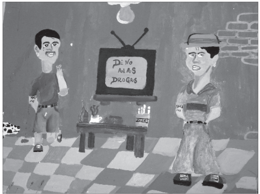
Painting by a young person participating in a prevention and rehabilitation program that reads, “Say no to drugs.”

Because evidence suggests that the most effective prevention programs build on community assessments and local partnerships, backed up by national resources, prevention program design should begin with a broad evaluation of the current situation in the various provinces and highly populated urban centers in each country, taking stock of the existing prevention, intervention, and rehabilitation programs run by community organization and churches. Because of a severe lack of resources and funding for social services in Central America, using these existing programs as a base to creating a comprehensive approach is the most cost