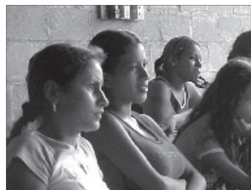
Young women at a center for at risk youth in Honduras.

Given these costs, effective violence prevention programs could save enormous